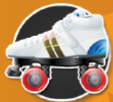
Free Roller Skating