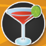
Free Open Bar