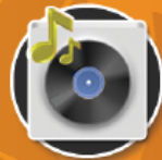
DJ Dance Party